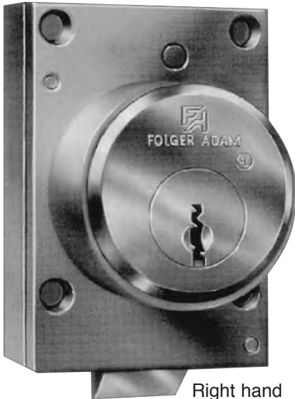
Right hand reverse bevel shown.